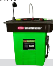
SW-28XE SuperSink XE Parts Washer