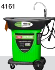
SW-23 Mobile Parts/Brake Washer