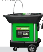
SW-37 Mobile Heavyweight Parts Washer