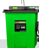
SW-25 Signature Parts Washer