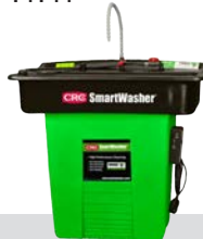
SW-28 SuperSink Parts Washer